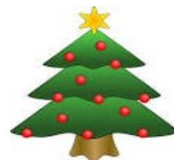
Sing Around the Tree

Friday, December 19 th – 3 Year Old Classes at 9:00 4 Year Old & Kindergarten classes at 10:00