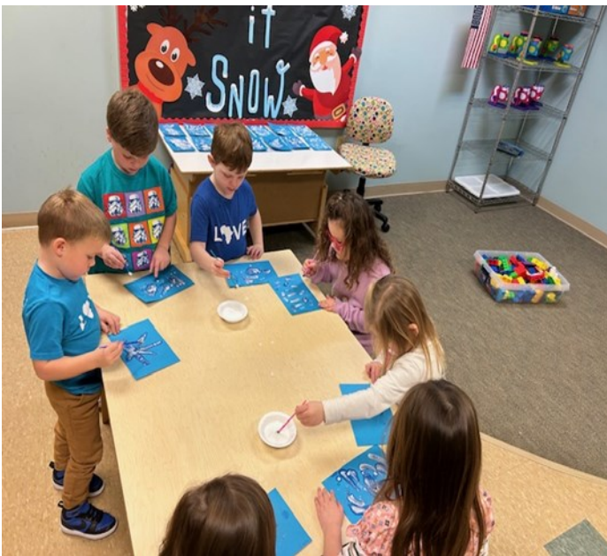
Top: Our 3's and 4's learn about following Jesus in Little Church.