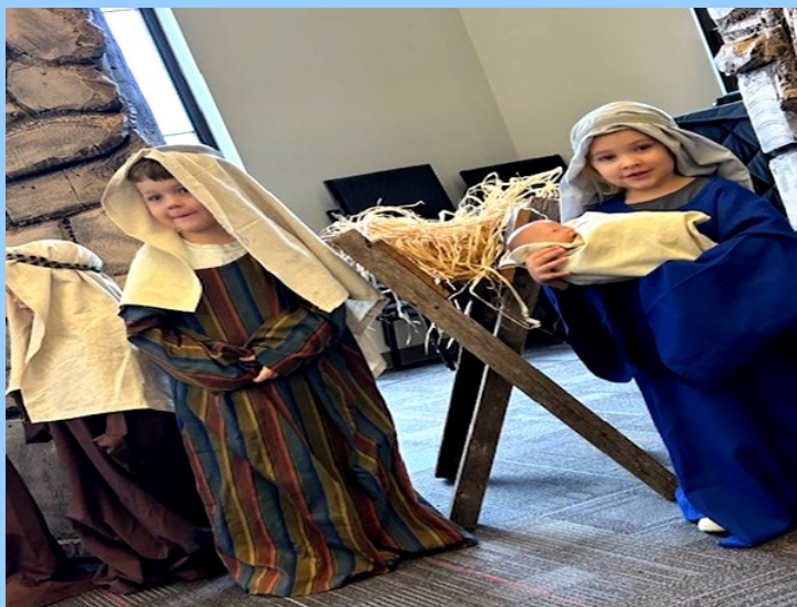
Pictured Above: 3-year-old, PreK, and Kindergarten classes performing at our annual Sing Around the Tree performance.