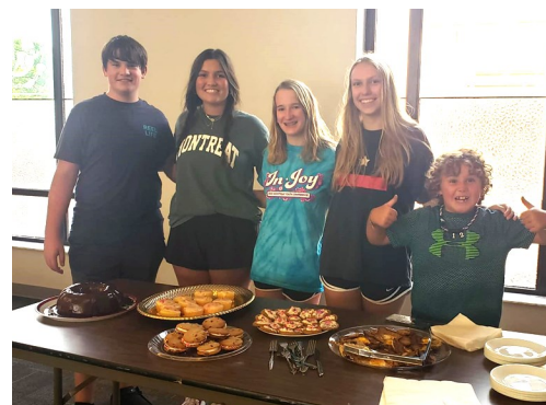
Youth Baking Contest

Bring your back-packs to be blessed as we offer prayers for the new school year. And invite a friend to join you!!