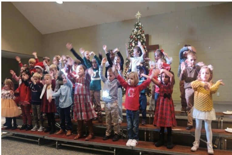
Pictured Above: 4-year-old and Kindergarten classes performing at our annual Sing Around the Tree performance.

This month we will begin registration for next school year and we will celebrate our 100 th day of school!!!