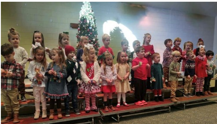
Pictured Above: 3-year-old classes performing at our annual Sing Around the Tree performance.